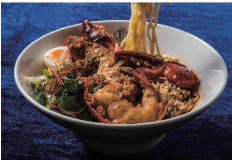
Lobster tom yum noodle Add mini rice 400 yen