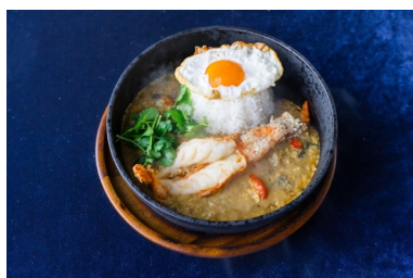
Stir fried shrimp with curry powder & egg 2,000 yen with mini noodle 2,300 yen