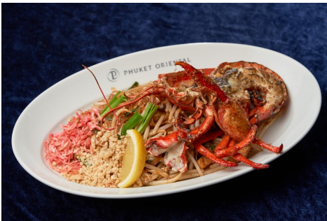
Lobster pad thai (Thai style fried rice noodle)