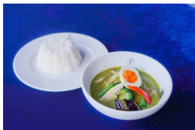
Chicken green curry 1,500 yen with mini noodle 1,800 yen