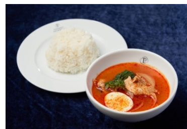
spicy curry with pork 1,500 yen with mini noodle 1,800 yen