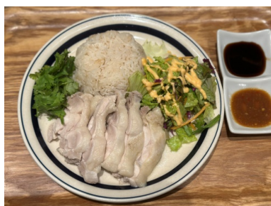
Thai style chicken rice (KHAO MAN GAI) 1,500 yen with mini noodle 1,800 yen