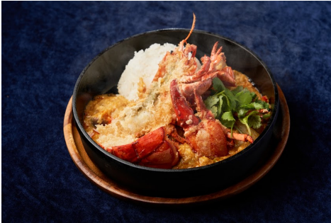
Stir fried Lobster with curry powder & egg