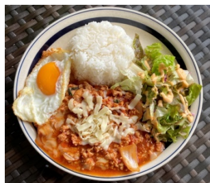
Tomato&cheese gapao 1,800 yen with mini noodle 2,100 yen