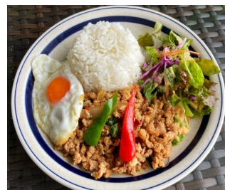
chicken gapao rice 1,700 yen with mini noodle 2,000 yen